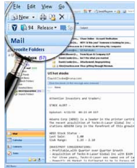
Quick and easy toolbar access to directQuarantine folder

The real advantage however, is the time IT administrators will save by putting the task of email quarantine management into the hands of end-users.